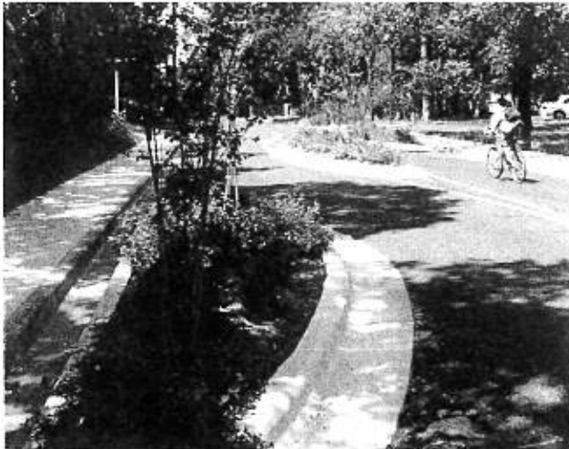
Bulb Out Planter