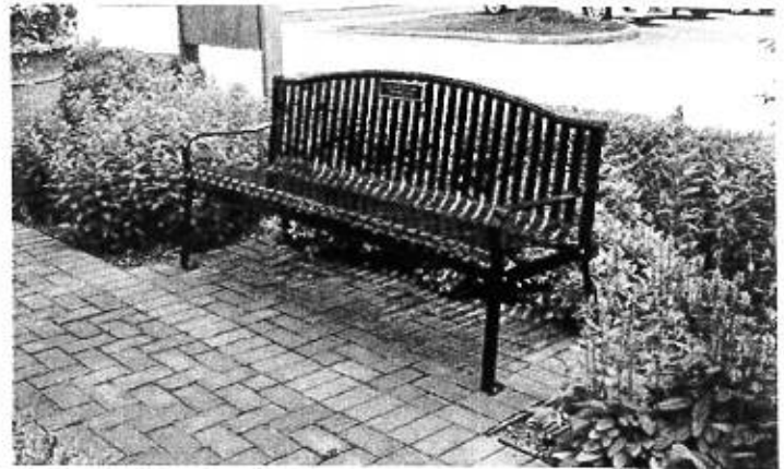
Bulb out with bench