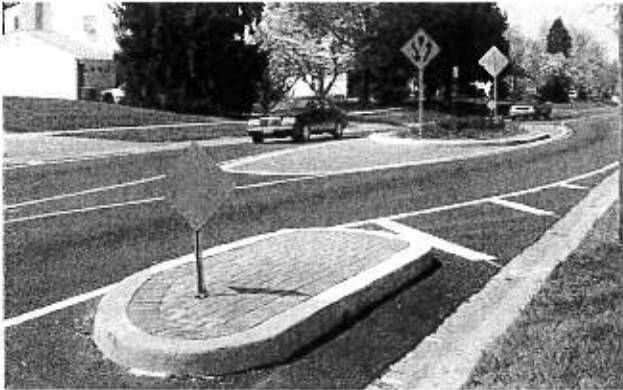
Stamped Brick Concrete on Bulb Outs